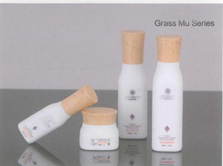
Grass Mu Series